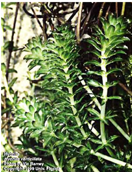
Hydrilla Hydrilla verticillata