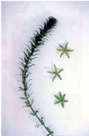
Dave Webb, TVA

Hydrilla management is another major cost. States are spending millions of dollars to control the pest in their waterways. Hydrilla is difficult to control and can cost as much as $1,000 per acre to treat. Mechanical, cultural, herbicidal, and biological management practices each cost anywhere from thousands to millions of dollars to implement. Florida has spent more than $50 million trying to control the plant in public waters. In 1994-95 alone, they spent roughly $10 million managing the epidemic. The number increased to $17.5 million in 2003-04. It is estimated that hydrilla is now in 40 percent of Florida's public waters.